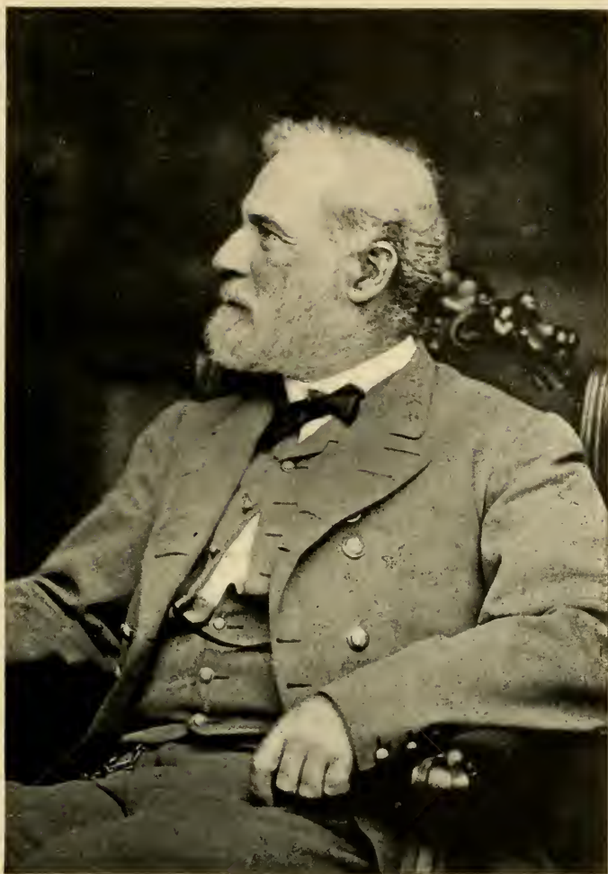
ROBERT EDWARD LEE

[AS GENERAL IN THE CONFEDERATE STATES ARMY]